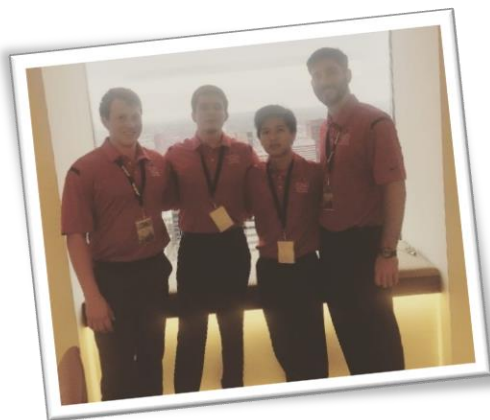
Petrobowl team for the 2016-2017 school year at their competition in Denver, Colorado.