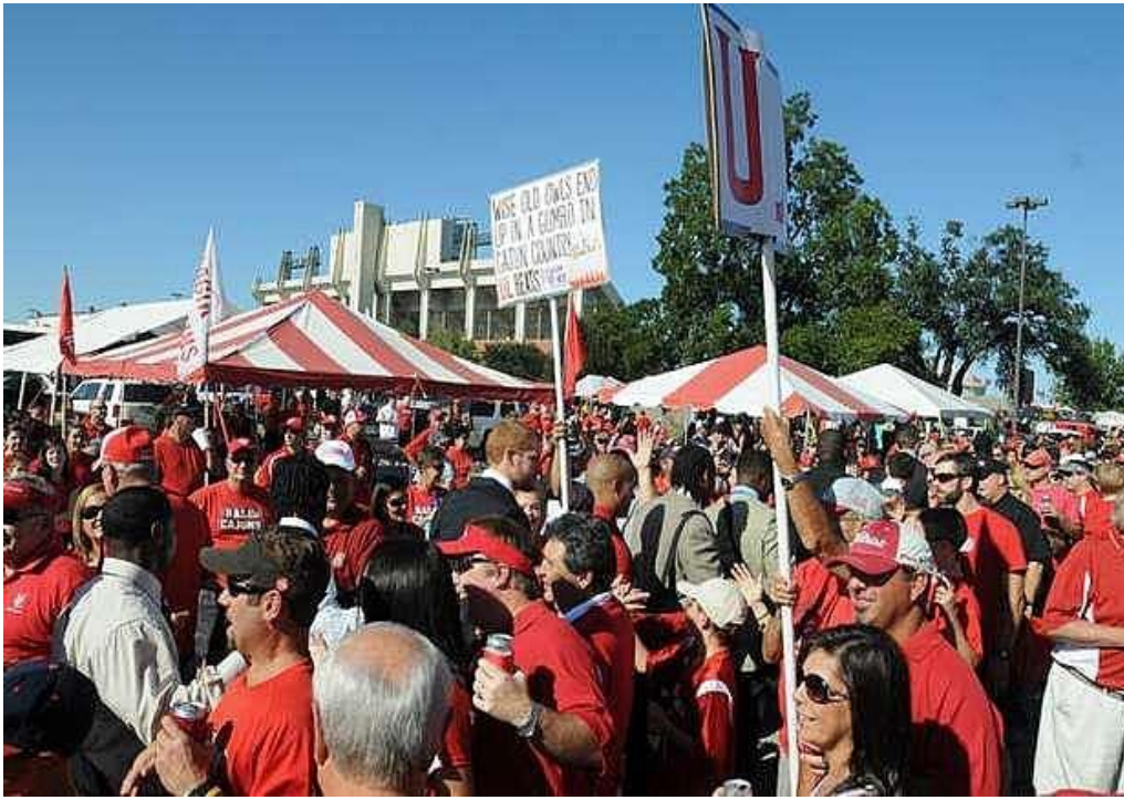
PEOPLE CELEBRATE LAST HOME GAME OF THE SEASON.